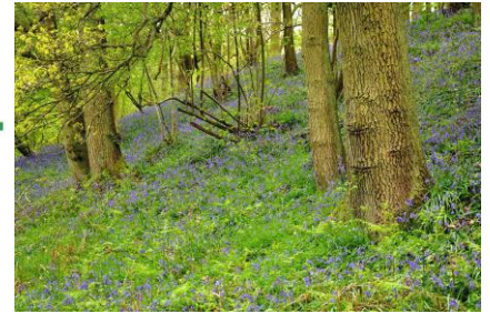
The heading picture this time: Bluebell woods near Ulverscroft Mill